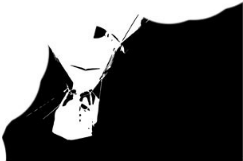
Portrait of a woman, 1911.